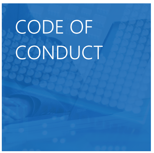
Fichtner GmbH & Co. KG | Sarweystrasse 3 | 70191 Stuttgart | Germany www.fichtner.de